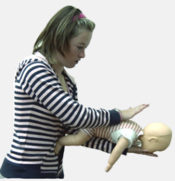
This is one method for infant- if having to act quickly where no seat is available to allow for positioning over the first aiders thigh.

Infant: Back blows - head downwards so gravity will assist with expulsion. Across your lap/thigh or over your arm. Chest thrusts – turn over.